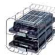
Mount >D< for 2 implant trays