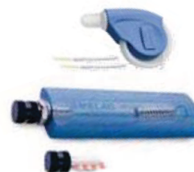
Test body (Helix)

MELAG Medical technology / Geneststraße 6 - 10 / 10829 Berlin