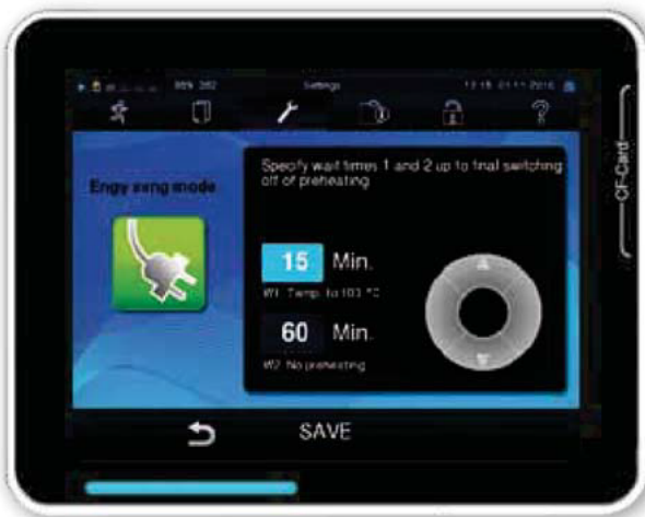
The settings in the energy-saving mode

The contribution of intelligent systems to time saving and environment protection