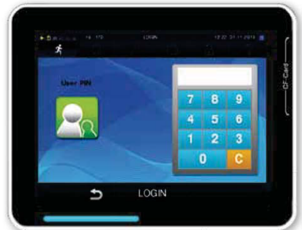
Individual operator PINs