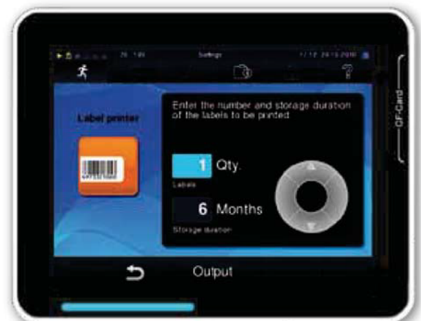
Selecting the number of labels and maximum storage period