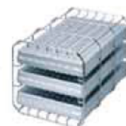
Mount >C< (rotated) for 3 standard tray cassettes