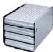
Mount >B< for 4 standard tray cassettes