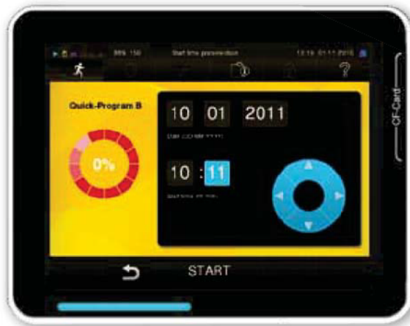
Time pre-selection for automatic autoclave start

As a family-owned company taking a long-term perspective, MELAG has a long record of environmental responsibility and resource-conservation. Our development and production operations always aim to conserve energy. Our Premium-Plus-Class