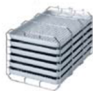
Mount >C< for 6 trays

Sterilization containers with paper filters provide a further method of sterilization with contamination-protected storage.